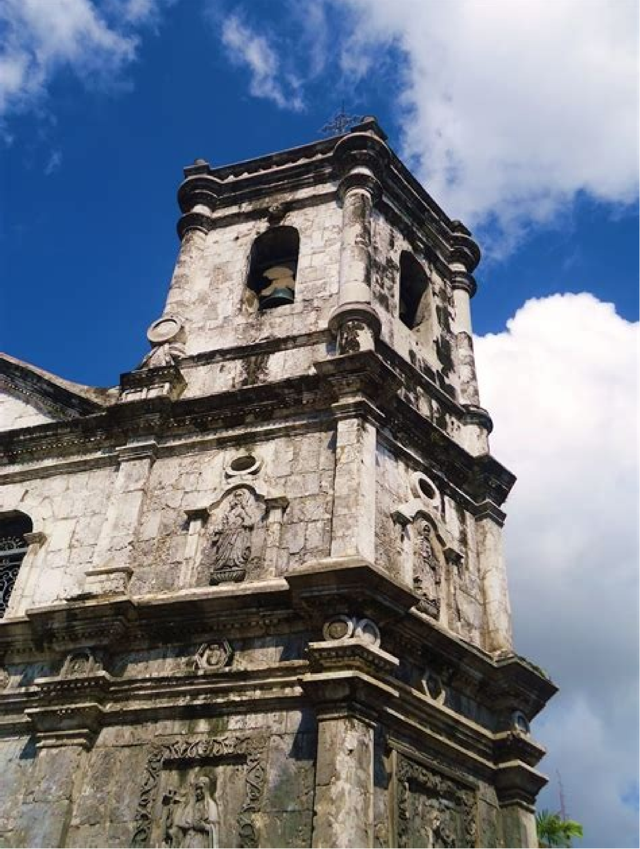
Prayer to santo nino de atocha. Powerful prayer to santo nino. Short prayer to santo nino. Miraculous prayer to santo nino. Miraculous novena prayer to santo nino. Novena prayer to santo nino de cebu. Daily prayer to santo nino. Prayer to santo nino de prague.